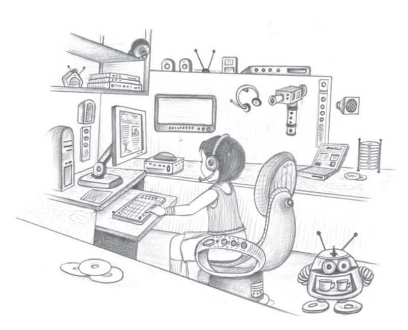
The mechanical teacher was flashing on the screen...

because her mother said little girls learned better if they learned at regular hours.