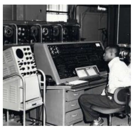
A UNIVAC computer at the Census Bureau.