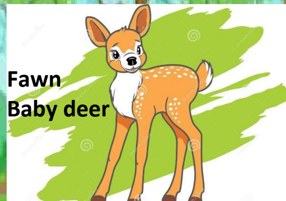
Fawn Baby deer

A little fawn is born. Mummy And papa are very happy.