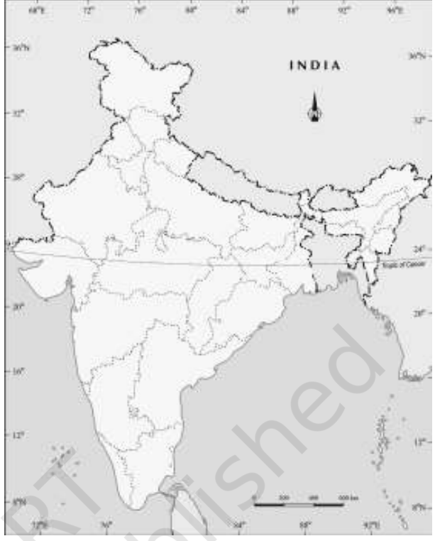
Note: Telangana became the 29th State of India on the 2^{nd} June, 2014, after the reorganisation of the State of Andhra Pradesh.