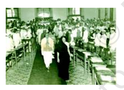
There was an extraordinary sense of unity amongst the members of the Constituent Assembly. Each of the provisions of the future constitution was discussed in great detail and there was a sincere effort to compromise and reach an agreement through consensus. The above photo shows Sardar Vallabhbhai Patel, a prominent member of the Constituent Assembly.

By the beginning of the twentieth century, the Indian national movement had been active in the struggle for independence from British rule for several decades. During the freedom struggle the nationalists had devoted a great deal of time to imagining and planning what a free India would be like. Under the British, they had been forced to obey rules that they had had very little role in making. The long experience of authoritarian rule under the colonial state convinced Indians that free India should be a democracy in which everyone should be treated equally and be allowed to participate in government. What remained to be done then was to work out the ways in which a democratic government would be set up in India and the rules that would determine its functioning. This was done not by one person but by a group of around 300 people who became members of the Constituent Assembly in 1946 and who met periodically for the next three years to write India's Constitution.