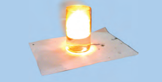
Fig. 4.5: Reaction of sodium with water

Take a 250 mL beaker/glass tumbler. Fill half of it with water. Now carefully cut a small piece of sodium metal. Dry it using filter paper and wrap it in a small piece of cotton. Put the sodium piece wrapped in cotton into the beaker. Observe carefully. (During observation keep away from the beaker). When reaction stops touch the beaker. What do you feel? Has the beaker become hot? Test the solution with red and blue litmus papers. Is the solution acidic or basic?